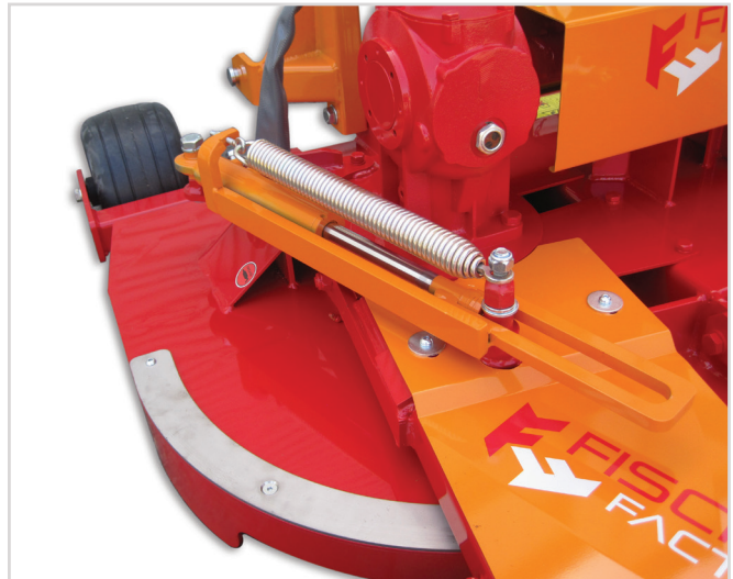
Heavy duty spring-actuated swing arms