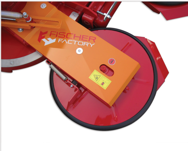
Oscillating cutting heads with rubber protection ring