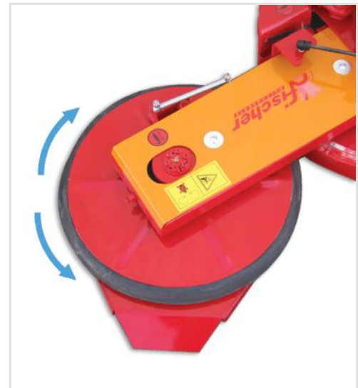
Oscillating cutting head with rubber bumper "rolls" around vines / stakes