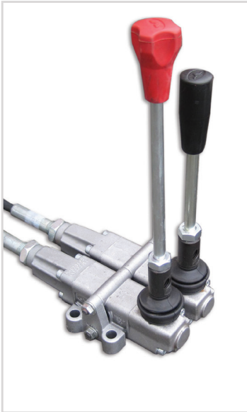
Dual Lever Controls—Cable operated control levers for mounting on tractor workstation.