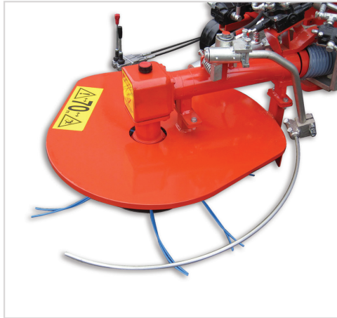
Fully adjustable sensor rod with sensitivity spring control.