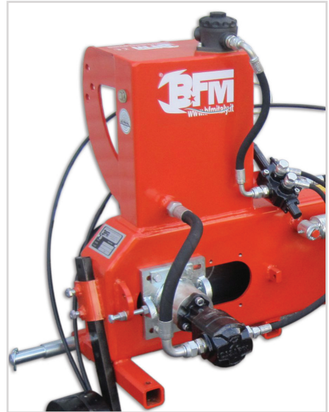
Fully self-contained hydraulic system (does not use any hydraulic oil from tractor).